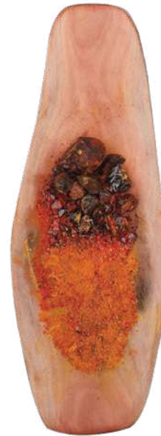
The Coolamon is a dish used for carrying bush food or in this case, used to crush Balga resin for tool making.